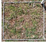
80% ground cover