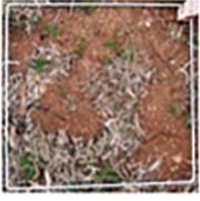
30% ground cover