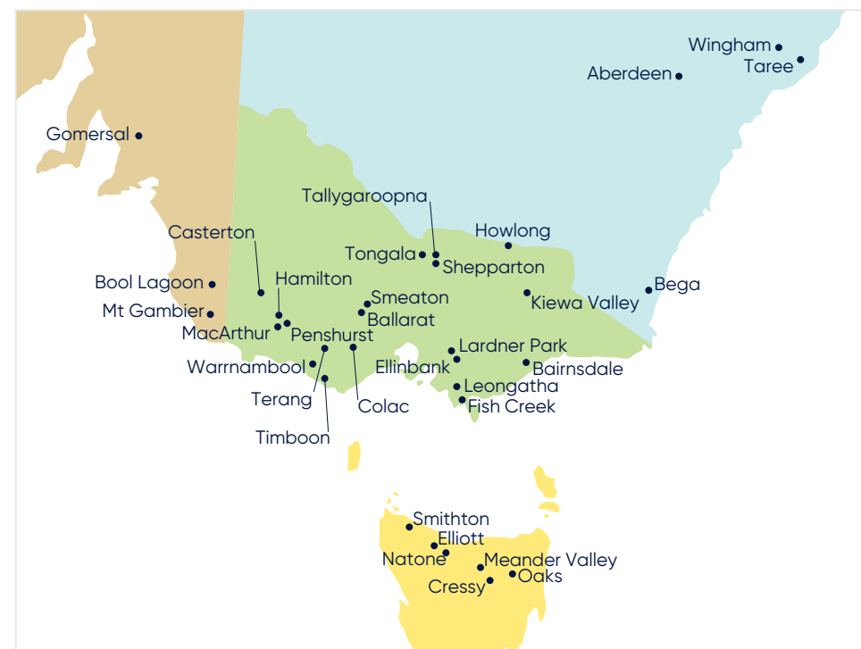
Figure 1 Map of trial locations across South-eastern Australia used in the 2026 FVI.

Often the price of a variety has little correlation to its position on the FVI list. Use the FVI to avoid overpaying for a variety that is poorly ranked.